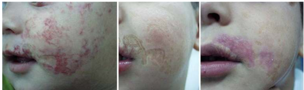
Fig. 2 A 2-year-old girl at time of CO 2 treatment; facial scar induced by hemangioma. Original hemangioma, scar before and 3 months after one treatment, parameters: 25 W and 200 ms pulsed duration

The present study reports the outcome of 24 children with facial scars treated with ablative fractional CO 2 laser photothermolysis. Although confluent ablative resurfacing with the CO 2 or Er:YAG laser remains the gold standard in skin rejuvenation, it is associated with considerable downtime and a risk of prolonged erythema, infection, scarring, and delayed hypopigmentation [8–11]. Moreover, it is painful and usually requires general anesthesia. In the search for alternatives that would also promote some collagen regrowth, researchers first turned to nonablative and intense pulsed light lasers [12, 13]. These were found to be safe but limited in efficacy, and the results were not comparable to ablative resurfacing.