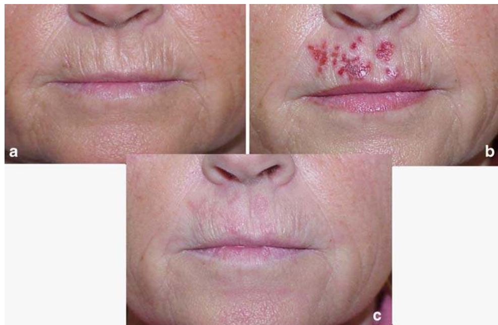
Fig. 4 Caucasian woman, 48 years old, skin phototype II, (a) before and (b) 1 week after fractional resurfacing of the upper lip. Tissue has healed after skin ablation, with clear improvement of the wrinkles; however, clear signs of herpes simplex infection are observed. c Aspect at 2 months after treatment. Herpetic lesion has healed without any scarring, but some lesion-related residual erythema is still present. Wrinkles are significantly better

Fractional resurfacing with Er:YAG laser with low incident doses and few passes for wrinkle treatment will obviously require more than one treatment session to enhance the condition of moderate to severely photo-aged skin. However, each subsequent treatment session at the same parameters will not go any further than the previous